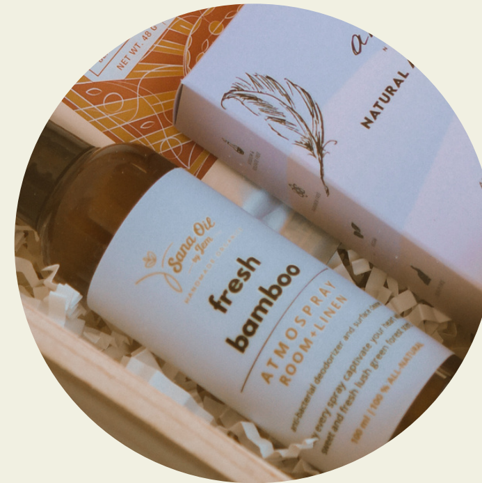
Room & Linen Spray