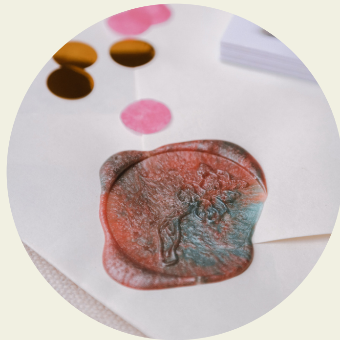
Wax-sealed Letter free with any of our boxes