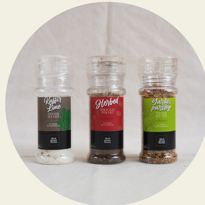
Infused Salt (Set)