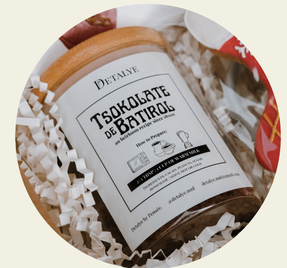
Tsokolate de Batirol

MOQ for custom-labelled beer, mini wine, and mini whiskey is 6pcs. MOQ for custom coffee and tea packaging is 12pcs. Tsokolate de Batirol is subject for availability.