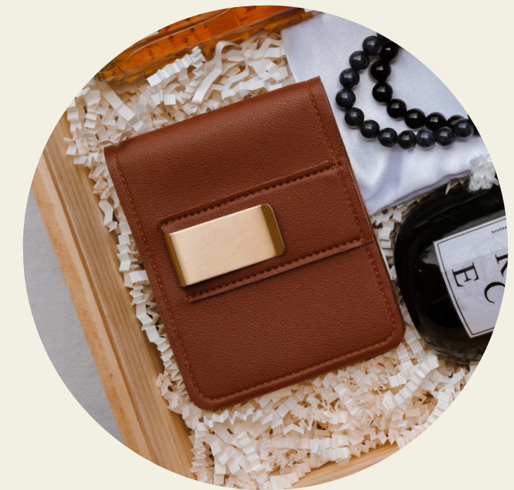
Card Holder with Money Clip