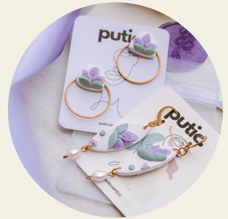
Custom Clay Earrings