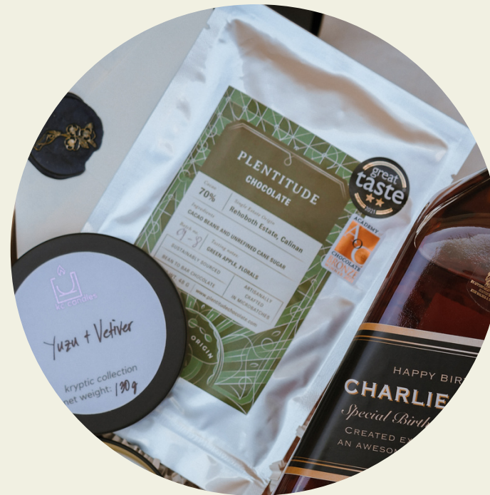
Artisanal Chocolate Bar