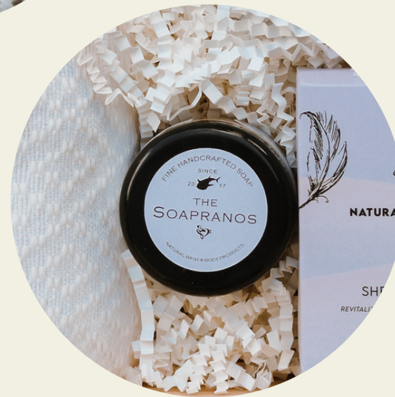
Face Cleansing Balm