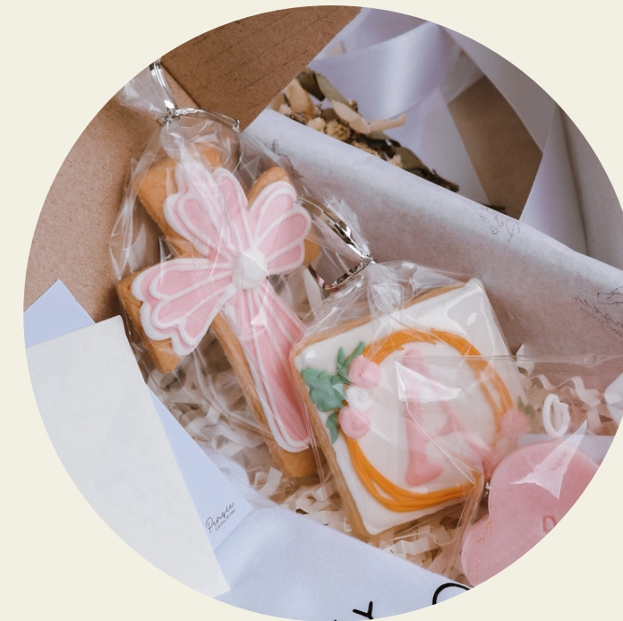
Custom Sugar Cookies MOQ: 12pcs per design