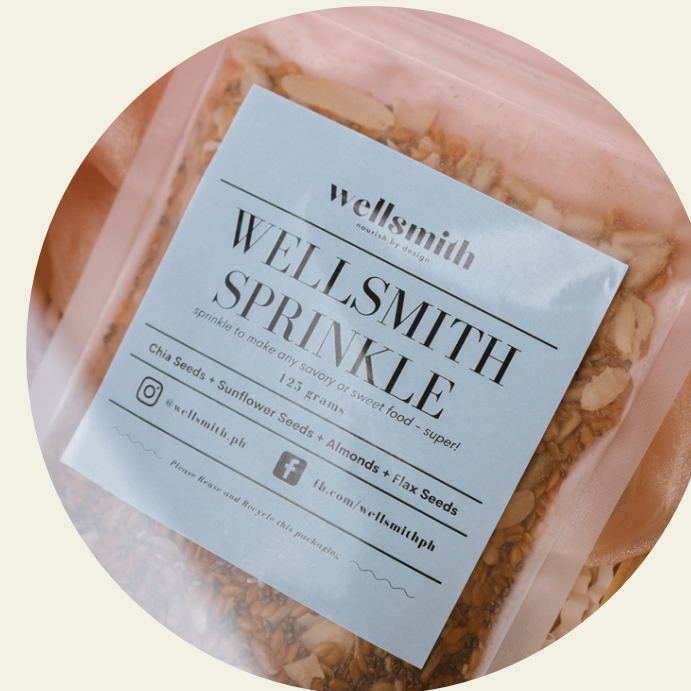
Super Seeds & Nuts