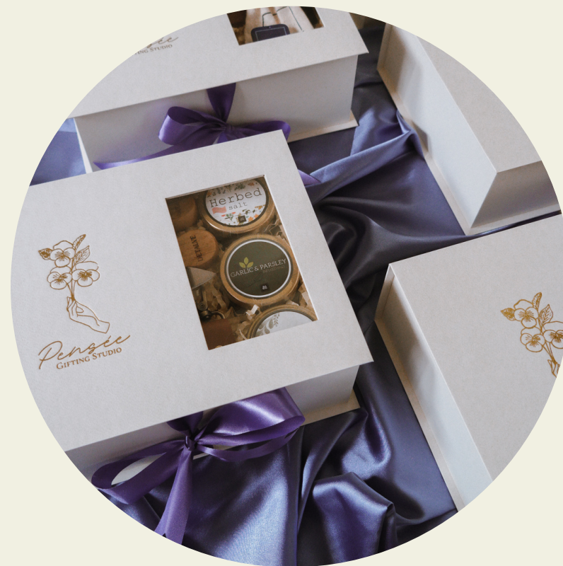
Signature Box Capacity: 3-4 items