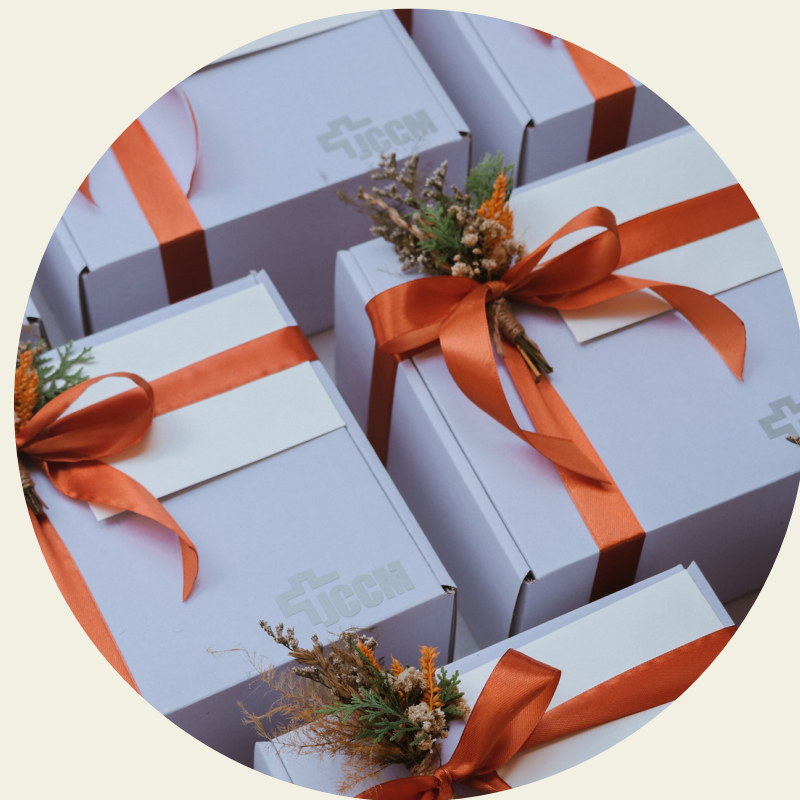
Petite Box Capacity: 2-3 items