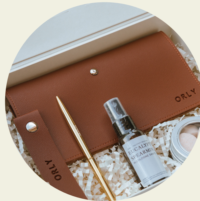
Mask Holder with Ear Saver