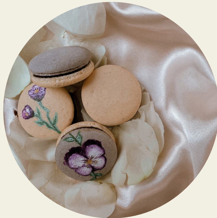
French Macarons MOQ: 12pcs per flavor, per design