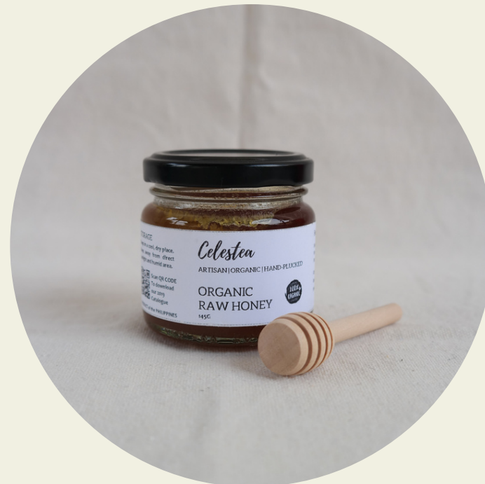
Organic Raw Honey