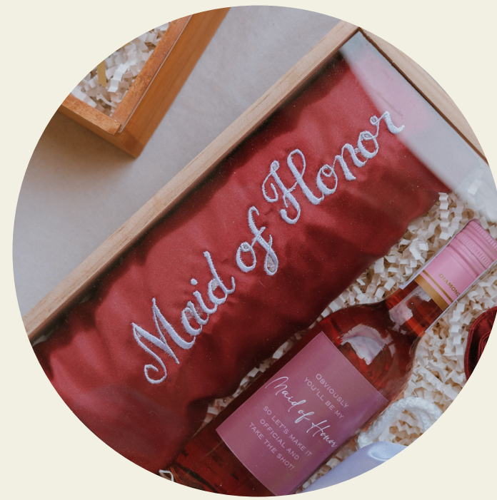
Satin Robe MOQ: 10pcs