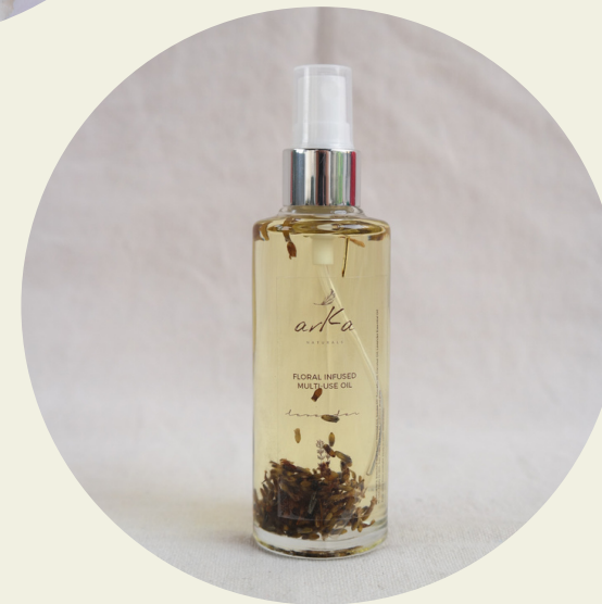
Floral-Infused Multi-Purpose Body Oil