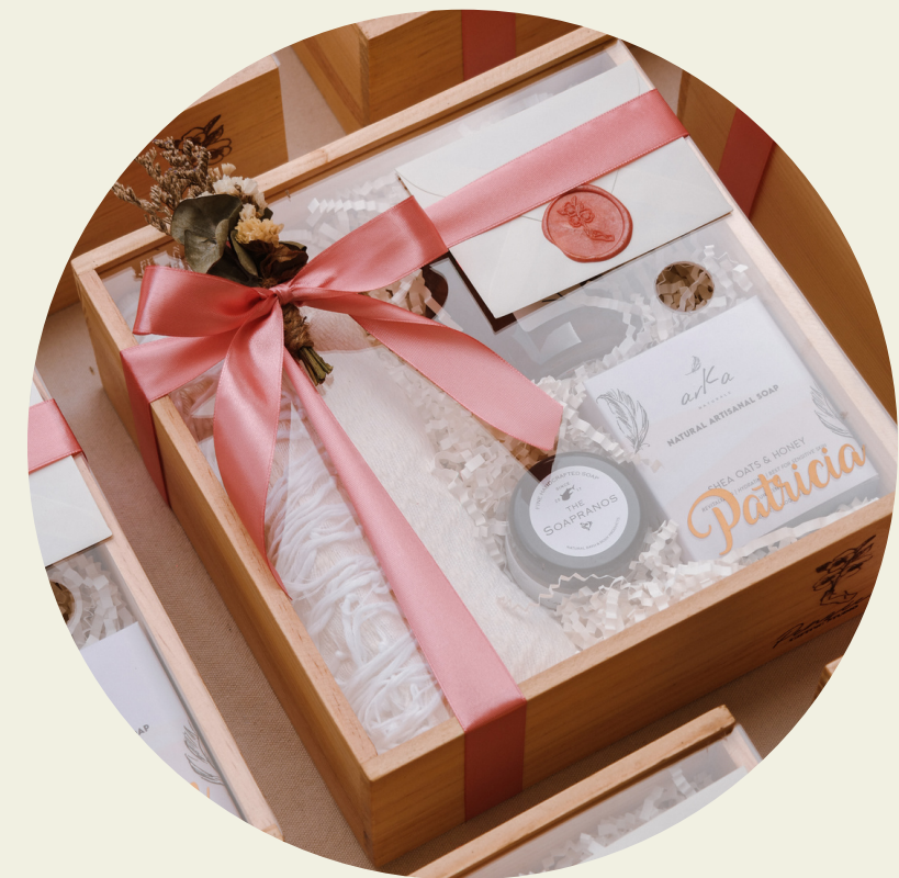
Premium Box Capacity: 4-5 items

Items/products which will not fit the chosen packaging are subject for box upgrade.